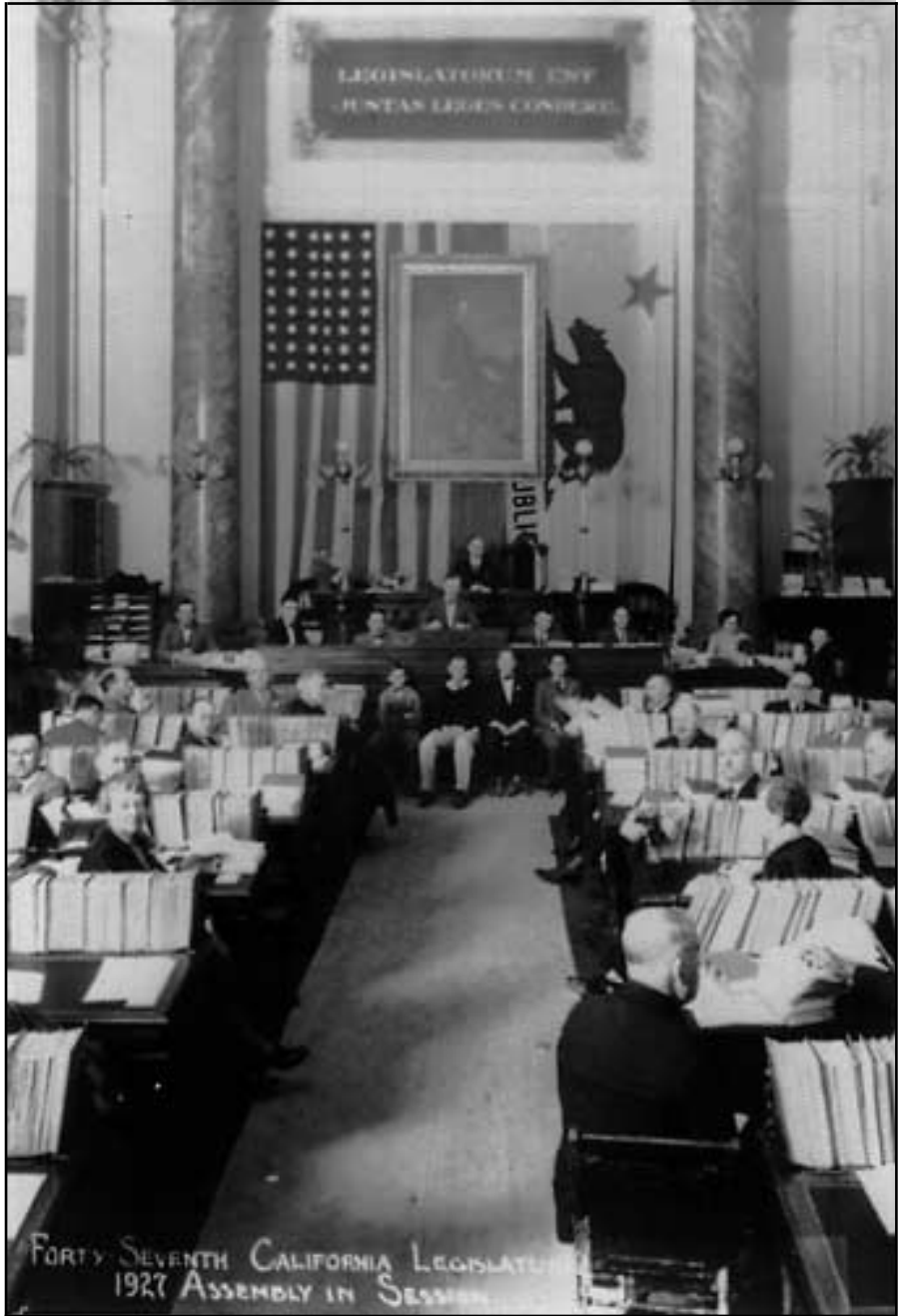
The California State Assembly in Session, April 26, 1927