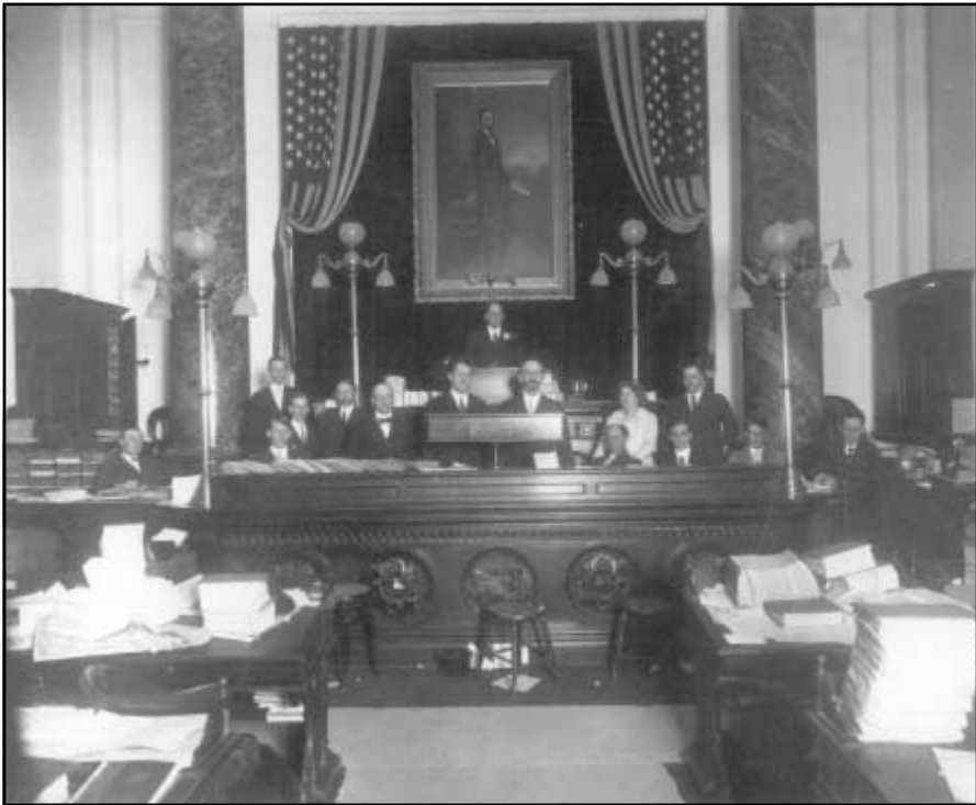
California Assembly in Session, circa 1910

The Legislature currently meets in a two-year session as a result of a constitutional amendment (Proposition 4) adopted in 1972. The Legislature convenes on the first Monday in December of the even-numbered years (e.g., December 2, 1996) and must adjourn by midnight November 30 of the following even-numbered year (e.g., November 30, 1998). 17 The first biennial session (1973–1974) saw the Legislature adjourn on September 1, 1974, well in advance of the constitutional deadline. This practice has been followed in each successive biennium and is likely to continue because another section of the Constitution limits the Legislature to the consideration of Governor's vetoes and urgency statutes, statutes calling elections,