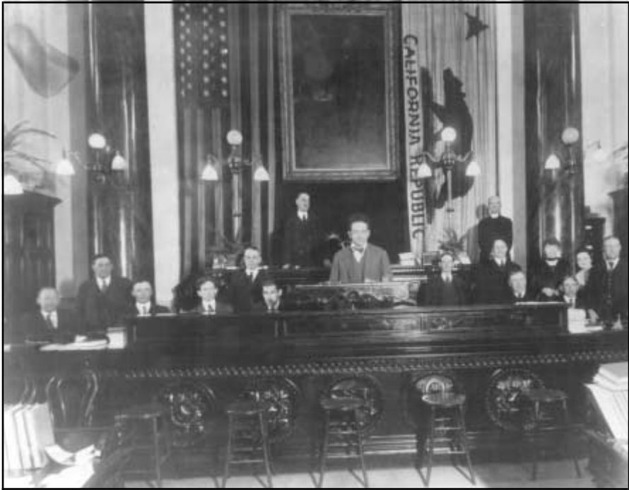
California Senate in Session, circa 1920

News of the admission of California into the Union reached San Francisco on October 18, 1850, months after the adjournment of the First Legislature, which adjourned on April 22, 1850, having been in session a little more than four months.